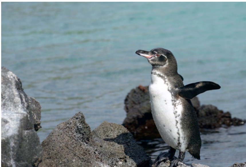
A great location for snorkeling to look for sea turtles and flightless cormorants in the waters.